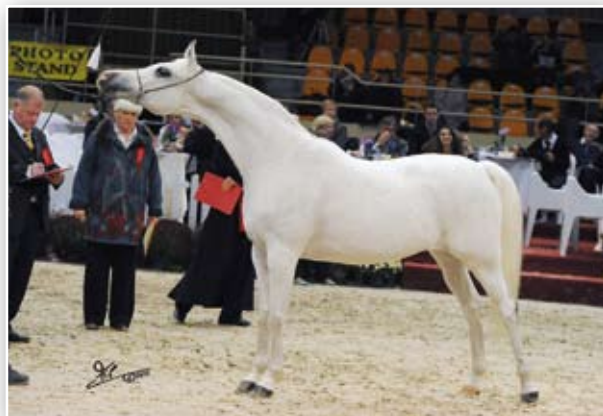
EMMONA Top Five Mares (Monogramm x Emilda) Breeder & Owner: Michalow Stud/Poland