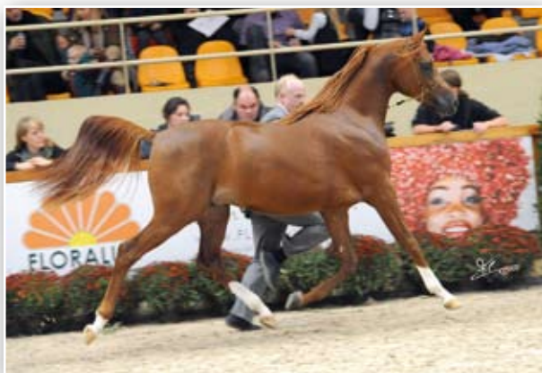
REVOLUTION 1 pl. Colts 2 Years