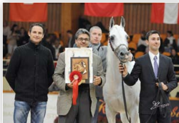
ELLISSARA 1 pl. Mares 8-10 Years