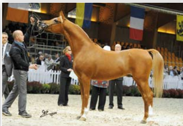
AV MONTOYA 2 pl. Stallions 4-5 Years

Breeder & Owner: Al Hambra Arabians/Austria