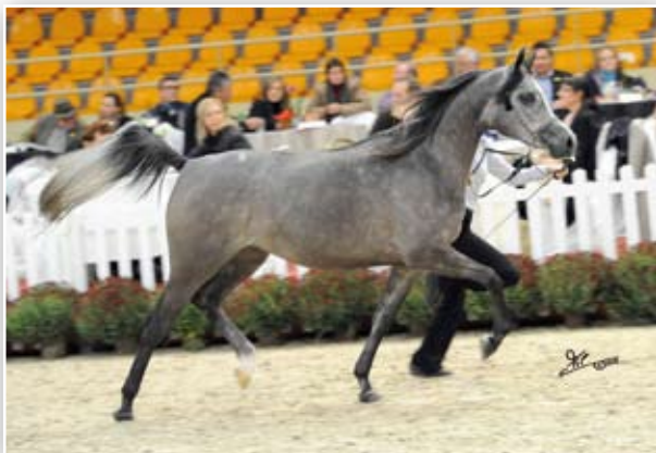
PSYCHE KREUZA Top Five Fillies (Ekstern x Pallas-Atena) Breeder & Owner: Chrcynno Palac Stad/Poland