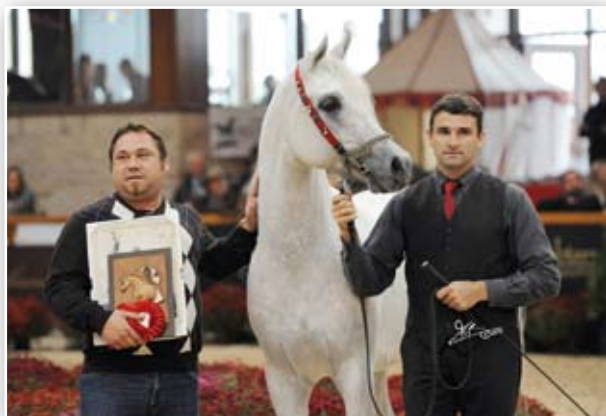
AL FAKHIR 1 pl. Stallions 4-5 Years