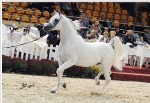
JHULYUSS IBN ETERNITY-D 2 pl. Stallions 6-7 Years

(Eternity Ibn Navarrone-D x Focus Julianna)