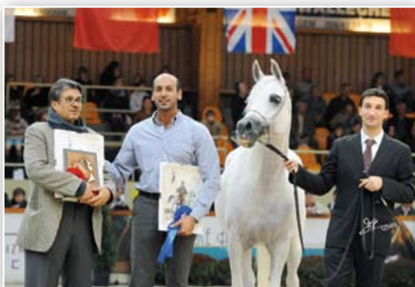
COL CORA 2 pl. Mares 8-10 Years

(Laheeb x Eksella) Breeder: Michalow Stud/Poland Owner: Athbah Stud, HRH Prince Abdulaziz bin Ahmed Al Saud/Saudi Arabia