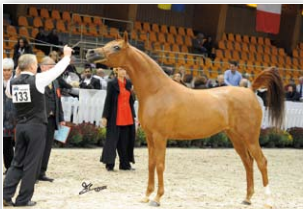
CENOZA Top Five Mares (Ekstern x Celnä) Breeder & Owner: Janow Podlaski Stud/Poland