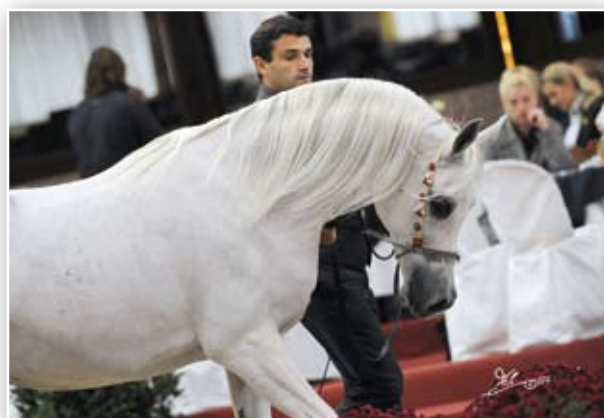
ZAGROBLA 2 pl. Mares 11 Years & over

(Wagner x Catika) Breeder: Az. Agir II Colle/Italy Owner: Dubai Arabians Horse Stud/UAE