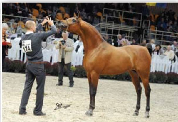
ABHA MIDAS 1 pl. Stallions 6-7 Years