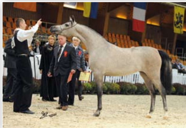
PIACENZA Top Five Fillies (QR Marc x Primawera) Breeder & Owner: Michalow Stud/Poland